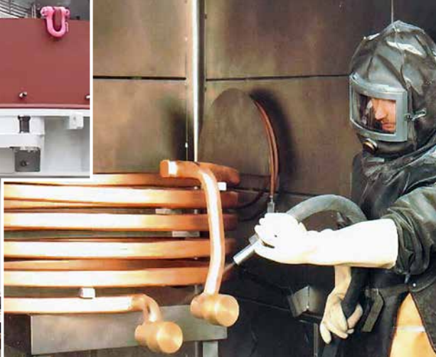
Sand blasting for gentle surface treatment