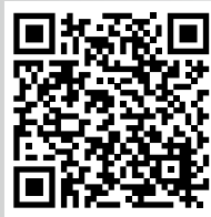
ALD Service Webpage

ALD Vacuum Technologies GmbH After-Sales-Services Otto-von-Guericke-Platz 1 63457 Hanau, Deutschland Phone: +49 6181 307-0 E-mail: service@ald-vt.de