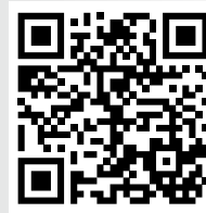
Video: ALD EXPERT EYE in use

Americas Metallurgy ALD Vacuum Technologies service-us@ald-vt.com Phone: +1 860 386 7227